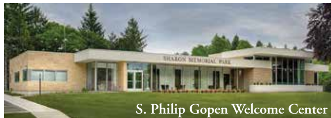
S. Philip Gopen Welcome Center

Choose your section & spaces • Advance Planning Cremation spaces • Interfaith Sections Private Family Estates