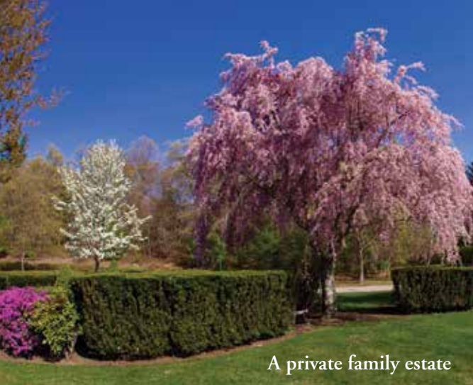
A private family estate